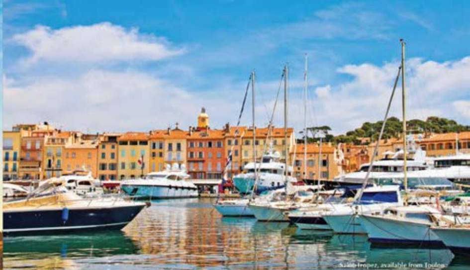
Saint-Tropez, available from Toulon